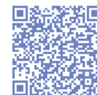
Study visit report