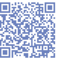
1st VBHC Conference Statement