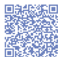
Paper on the Cohesion policy ‘21-’27