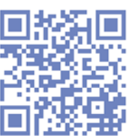
EWRC's event report