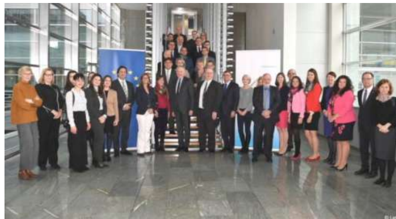
Above, Two-day study visit in Lower Austria, March

The study visit (14 and 15 March) included a visit to the Hospital of Melk and a presentation on the projects Unlimited Health Together and Bridges for Birth . Both projects are excellent examples of cross-border hospital cooperation. On the 15 of March, the participants visited the Hospital of Gmünd and heard about the Healthacross