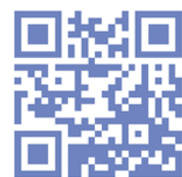
EU Health Coalition

can be ensured when the Health Programme will be implemented within the EFS Plus Regulation. Moreover, the Coalition believes that smart specialisation strategies should be flexible and easy to accelerate the way the market of pan-European works.