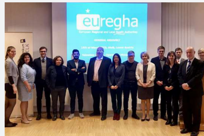
Above: Executive Board family photo, General Assembly

2019 Executive Board: Catalonia, Emilia-Romagna, Flanders, Scotland, Lower Austria, Ostergotland, Tuscany, and Wales. For further information consult the General Assembly's section below.