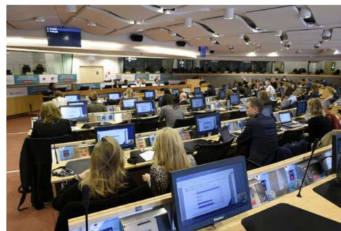
Above: The SDGs for a Healthy Social Europe, 9 October