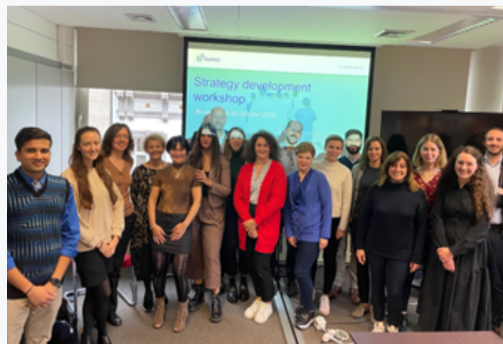
BeWell Partners' meeting in Brussels (20 October).