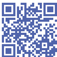
EUREGHA 10th Anniversary Page

In 2022, EUREGHA had the pleasure of celebrating its 10th anniversary as a reference network for regional and local health authorities. A beautiful milestone to celebrate, reflecting on the last 10 years and looking forward to the years to come. The Secretariat collected video-testimonials from EUREGHA members to hear in their words what the value of EUREGHA membership is, and how they hope the network will develop itself in the future.