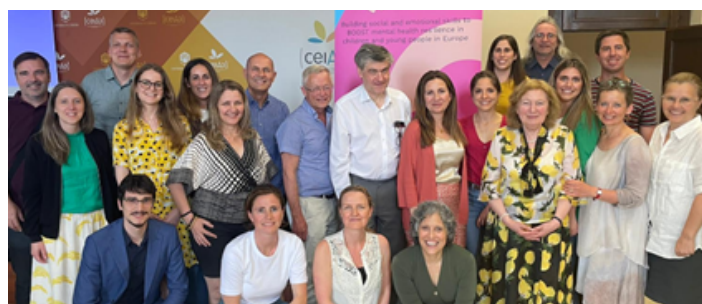
BOOST Mental Health Consortium meeting in Córdoba (May 2022).

Finally, as proof of the potential of BOOST in mental health promotion, the project featured in the European Commission's Healthier Together – EU NCDs Initiative, published in June 2022, among the key initiatives and actions to promote mental wellbeing of the population in the EU.