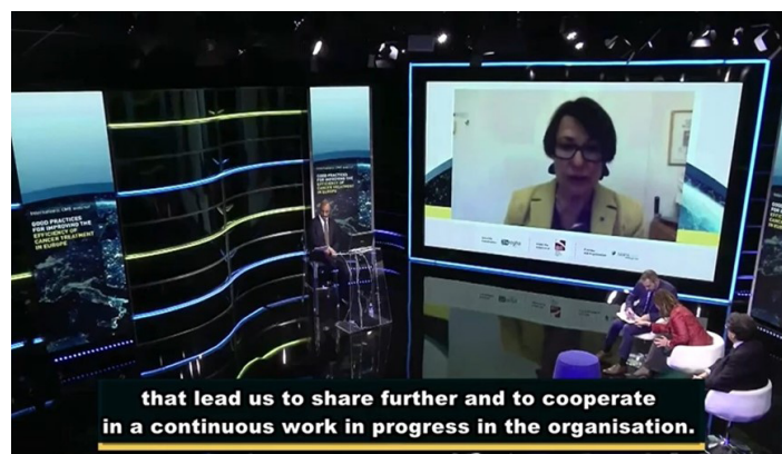
International Webinar "Good Practices for improving the efficiency of cancer treatment in Europe", Bari, Italy and online (5-6 May 2022)

tients, and the role of the Veneto Oncology Network in combining clinical trials with real-world evidence.