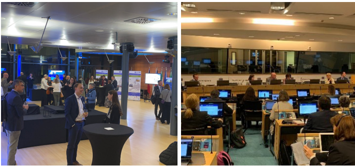
EUREGHA and WHO Regions for Health Network Joint High-Level Conference, 5 December 2022, European Committee of the Regions

Following the closing of the event, onsite participants had the chance to network and exchange views while visiting an exhibition of regional profiles and best practices from both EUREGHA and WHO RHN members.