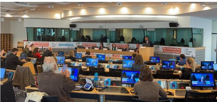
EUREGHA session at European Week of Regions and Cities, 13 October 2022, European Committee of the Regions