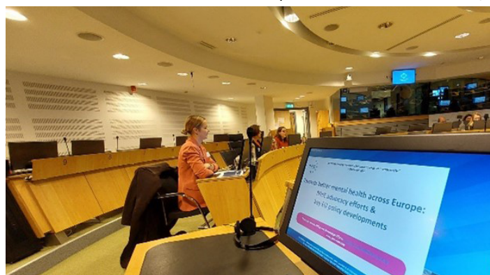
CoR Interregional Group on Health and Wellbeing on Mental Health – (December 2022).