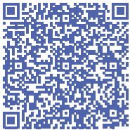
Annual Conference event highlights

EUREGHA and the WHO's Regions for Health Network (RHN) jointly organised a high-level conference on Monday, 5 December 2022, with more than 100 participants attending in person and 50 joining online. The event was an opportunity for the networks to celebrate their respective 10th and 30th anniversaries and to discuss the role of regions in building and boosting more resilient and future-proof health and care systems in Europe. High-level representatives from the European Commission, WHO Europe, the European Observatory on Health