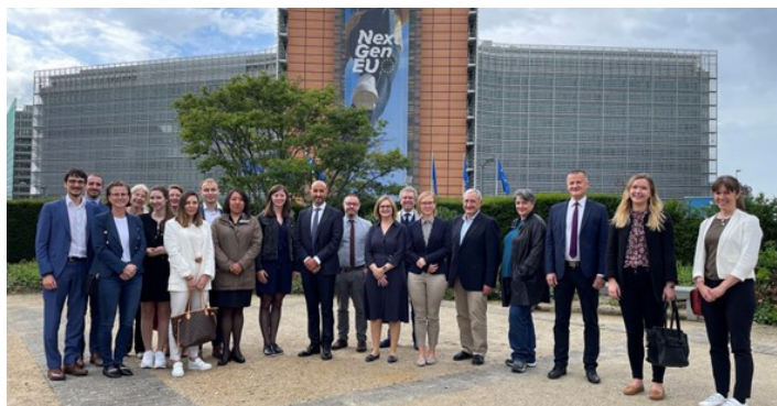
EUREGHA General Assembly 2022, Brussels, Belgium (8-9 June 2022)