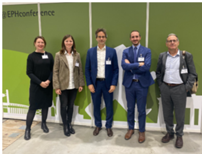
EUREGHA's Director with representatives from Lower Austria, euPrevent, WHO RHN and AEHR at the EPH Conference (November 2022)

Another noteworthy activity in the framework of EUREGHA's cross-border healthcare in 2022 was the participation of EUREGHA in a session organised by EUREGHA Member Lower-Austria/HealthAcross during the European Public Health Conference in Berlin. The session allowed to foster relationships between EUREGHA, involved members and key stakeholders such as the WHO Regions for Health Network and AEHR - Association of European Border Regions.