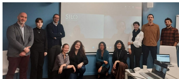
Health InnoFacilitator Kick-Off meeting, Paris (7-8 November 2022)

advances towards Public Procurement of Innovation (PPI) is equally a strategic goal of the project. In InnoFacilitator, EUREGHA will lead the work of Work Package 2, building and maintaining a lively community of experts in innovation procurement through a dedicated platform and continuous engagement throughout this 24-months project.